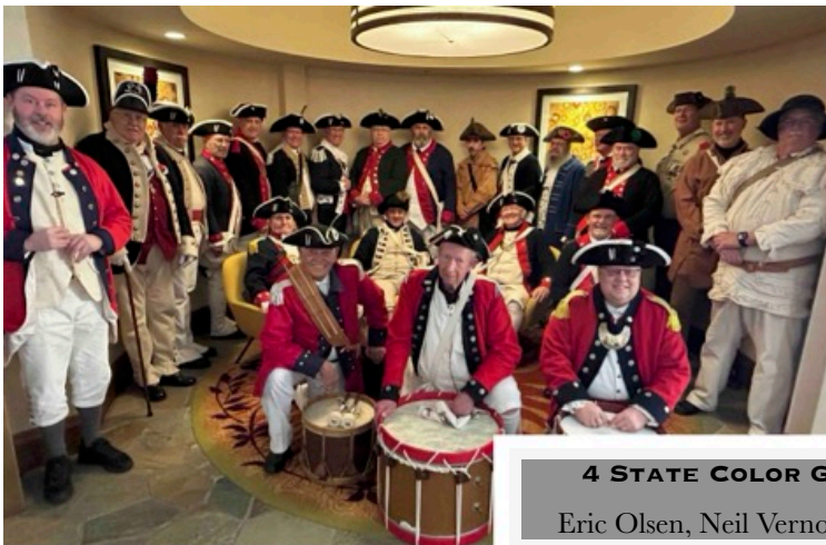
4 STATE COLOR GUARD COMMANDERS