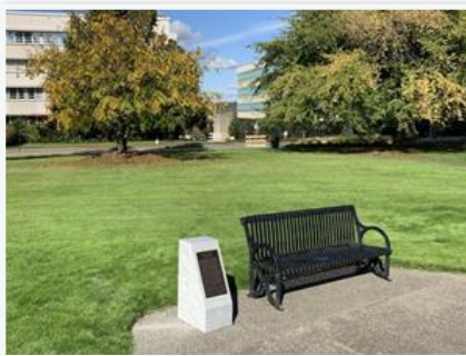
George Bush monument with butternut tree on left, Olympia Capitol Campus

It began in the mid 1840s and is filled with mind boggling coincidences. In 1844, a black man named George Bush led a wagon train from Missouri to the Oregon territory. After facing racist persecution in Oregon territory, he crossed the Columbia River and settled in the area we