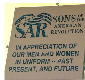
The wall tile