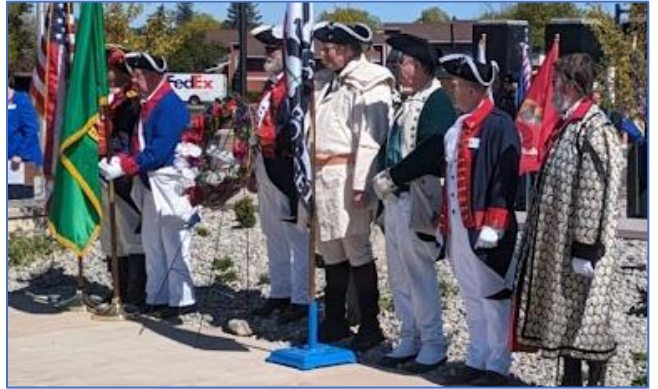
The opening Ceremony

18 May: posted the colors for the Toastmasters regional meeting.