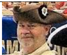
Larry Flint Mid-Columbia Chapter