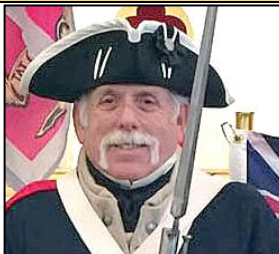
Fred Gilbert John Paul Jones Chapter

Counties: Clallam, N Grays Harbor, Jefferson, Kitsap, Mason