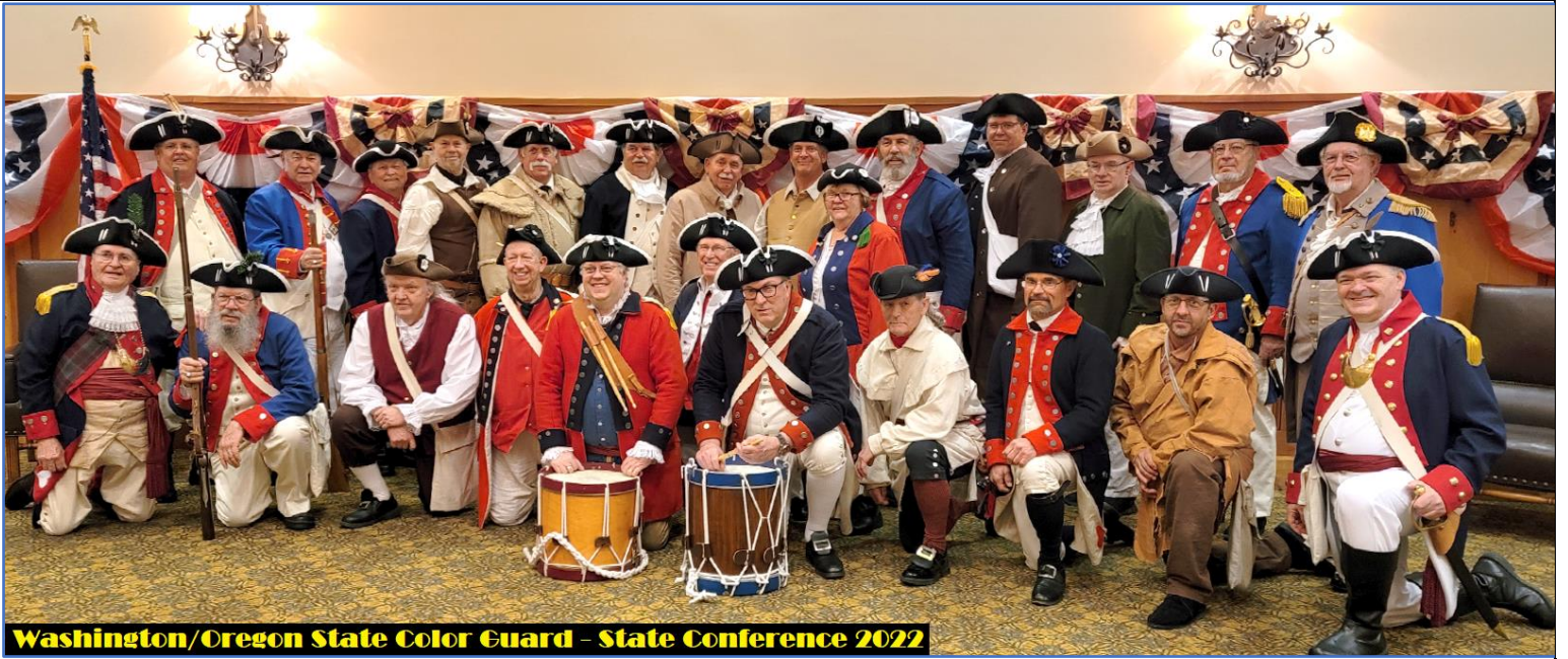
Washington/Oregon State Color Guard - State Conference 2022