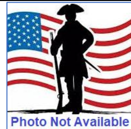
Photo Not Available TBD Ranger Chapter

Counties: N King, Skagit, Snohomish, Whatcom, Island, San Juan